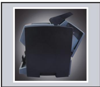
Compact design with easy access to bill path for jam removal and daily maintenance