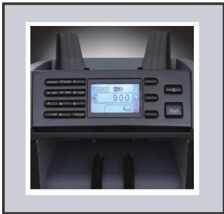
2.8 Inch LCD display with full graphic user interface.

Small enough for any desktop, the XCOUNT+ features latest IR-array sensing for currency recognition as well as multi-detection sensors against latest counterfeiting attempts, while still maintaining low false alarm and improve currency recognition rate.