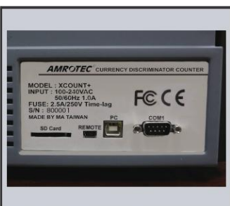
Various I/O ports for PC connectivity, SD card, Printer & Remote display.