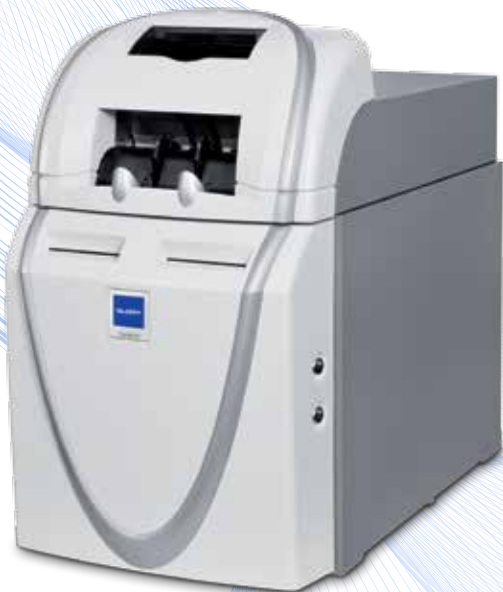
(shown with optional dual dropbox facade)

staff hassle and fewer interruptions during customer engagements. Routine daily operations can be accomplished with minimal cash exposure, fewer out-of-balance issues and write-offs. Vertera has been designed to optimize branch cash handling requirements, provide a better staff experience, and superior, uninterrupted customer engagements. Cash Recycling is enabling technology that fully supports smaller branch designs, open plan banking, universal teller concepts, cross-selling and relationship-building initiatives.