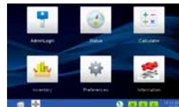
(7" Color Touch Panel Display)